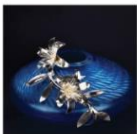
ArgentOr Silver This blue glass vase is adorned with floral detailing in 92.5 sterling silver and features a glossy finish. It will make an opulent impression on a coffee or side table. ₹ 32,500