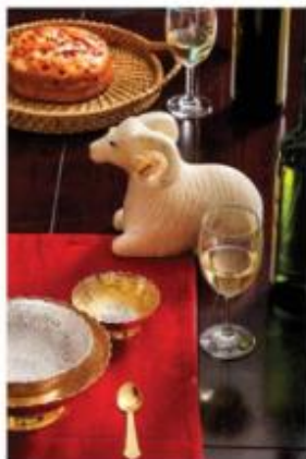
Fanusta Effortlessly elegant: a Gold Plated Sheep showpiece hand-carved in marble and accented with gold plating of 18-karat on horns. ₹ 8,999