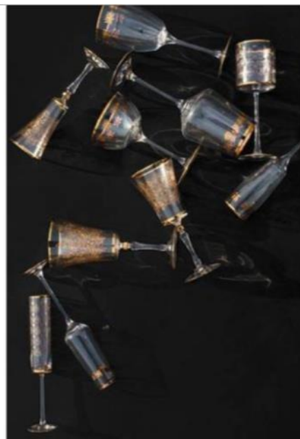
Rohit Bal The designs of the stemware range from the Crystalware Collection display classic Rohit Bal styles — from lotus gardens to dancing peacocks — that blends strong Indian sensibilities with European craftsmanship. Price on request