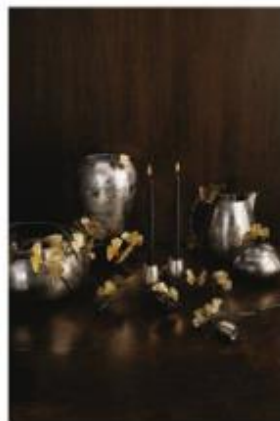
The House of Things Michael Aram's Butterfly Ginkgo collection celebrates the Ginkgo Biloba plant, which grows with a double leaf. Handcrafted from stainless steel and bronze, the range has diverse dining table offerings. Price on request