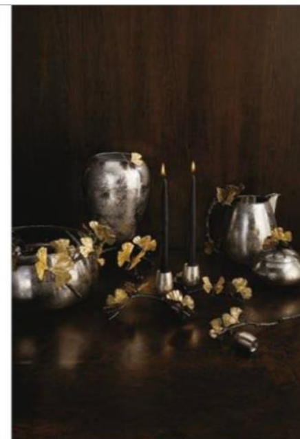
The House of Things Michael Aram's Butterfly Ginkgo collection celebrates the Ginkgo Biloba plant, which grows with a double leaf. Handcrafted from stainless steel and bronze, the range has diverse dining table offerings. Price on request