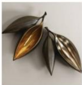
Address Home The Pod Platter in ceramic is available in two versions: black and gold, and black and silver. The dull sheen of the black in tandem with the luxurious luster of gold/silver is a perfect fit for the Christmas table. ₹ 2,990