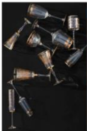
Rohit Bal The designs of the stemware range from the Crystalware Collection display classic Rohit Bal styles — from lotus gardens to dancing peacocks — that blends strong Indian sensibilities with European craftsmanship. Price on request