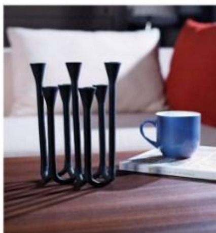
It's All About Home Slender and minimal, the 7 Lite Taper Candle Holder made from cast aluminium is a must-have for a modern Christmas table setting. ₹ 2,495