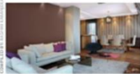
COMPILED BY: KALSHRUTI KALSHRUTI

Make your diwali astounding by embellishing your table and kitchen spaces with statement tableware launched by Arttd'inos . Crafted in pure stainless steel with PVD coating, the fruit baskets, platters, tissue holders, vases and