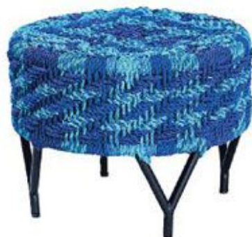
The Purple Turtles Pipe Frame Pouffe, ₹ 3,068

Featuring a cheerful bird perched on a tree branch, this cushion cover will sit pretty on a bamboo or wicker chair