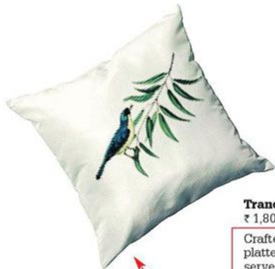
Ficus Fine Living cushion, ₹ 1,850

Featuring a cheerful bird perched on a tree branch, this cushion cover will sit pretty on a bamboo or wicker chair