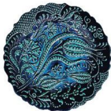
The Great Eastern Home plate, price on request

These accessories in different hues of blue, don't just capture the mood of the moment, but also promise to add a touch of elegance to your home