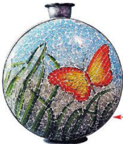
Fanusta vase, ₹ 12,250

This metal vase features a delicately composed mosaic depicting a flitting butterfly in a garden