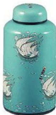
Good Earth Xanadu Canister, ₹ 11,000

Let your imagination drift away with this chinoiserie-style depiction of boats in the deep seas