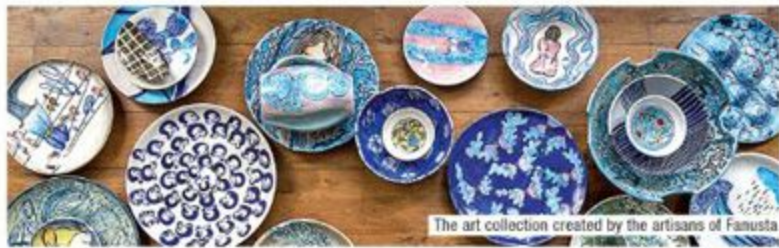
The art collection created by the artisans of Fanusta

While sharing the uniqueness of Fanusta, Shailender said that the design element and colour of the products are unique than any other. He added, "We have used the traditional old art but experimented it with new modern designs that include contemporary and surreal designs. We have also introduced the 'Monsoon Range' in our designs